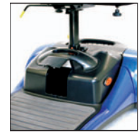
Convenient Built-in Charger Compartment